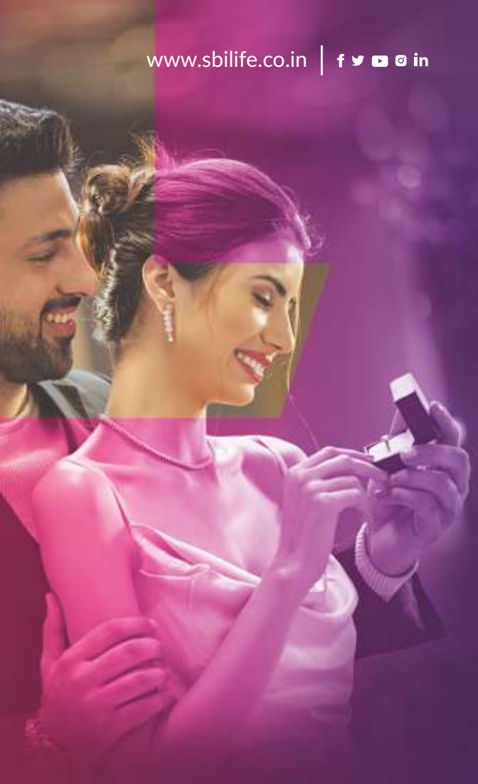
Chart your own path through life's milestones with money back at regular intervals